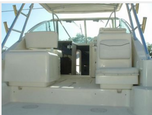
Livewell and aft facing seat