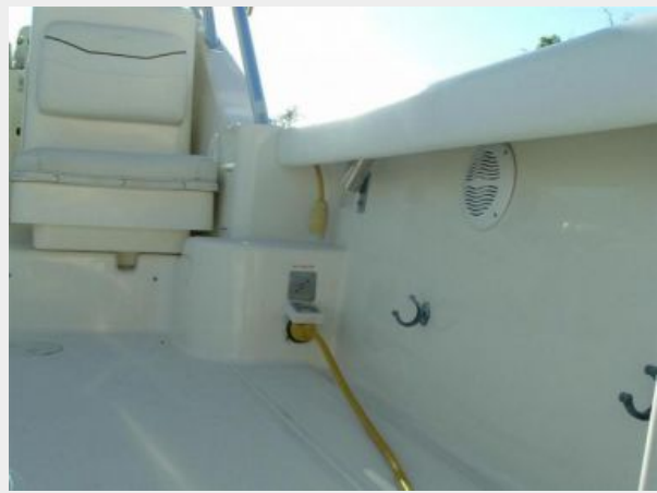
Starboard deck level