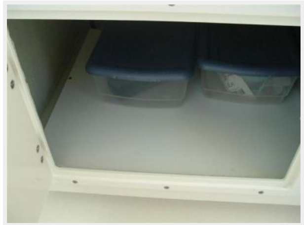
Helm storage II