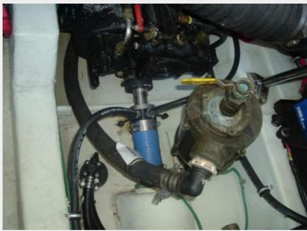
Starboard tranny shaft