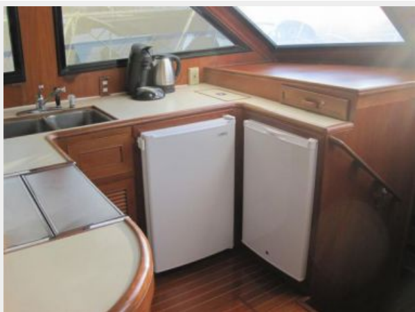
Refrigerator and freezer