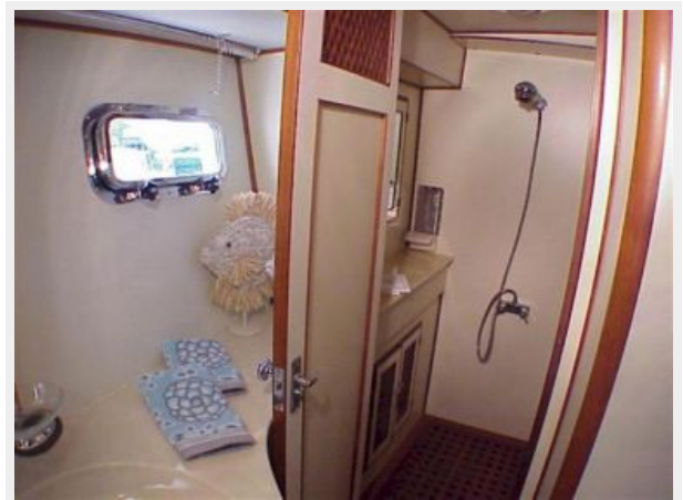
Master Bath w/ Adjoining Shower