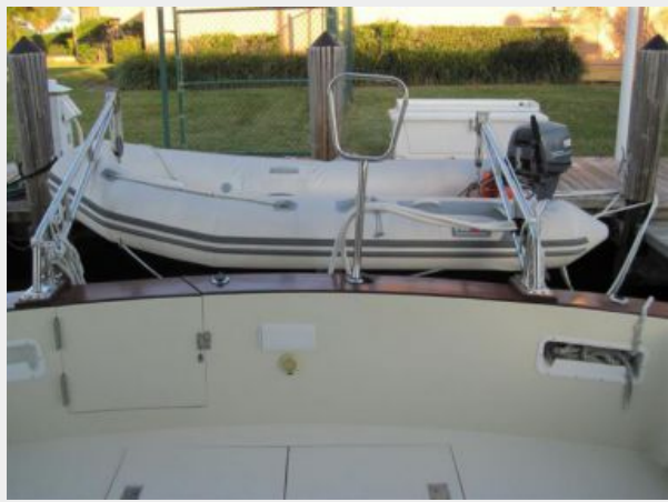
St. Croix Davits