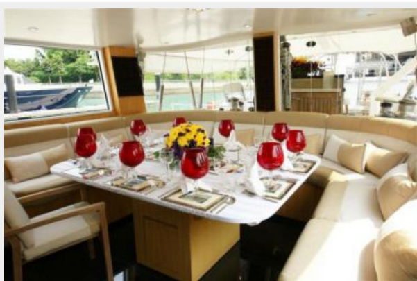
Unique Surround View