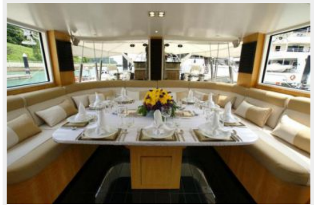
Set for Dinner