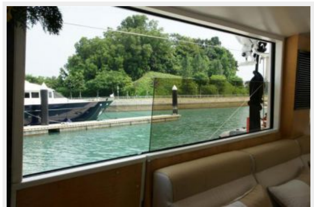
Electrically Operated Windows