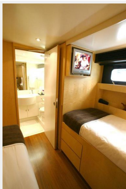
Guest Cabin with twin berths