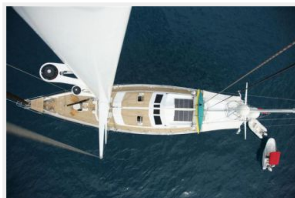
bird's eye view