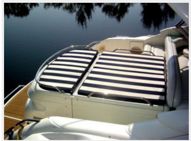
Aft Sun Pad