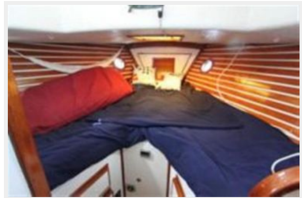
Forward guest cabin