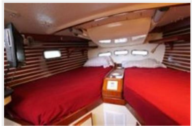
Master aft facing stern