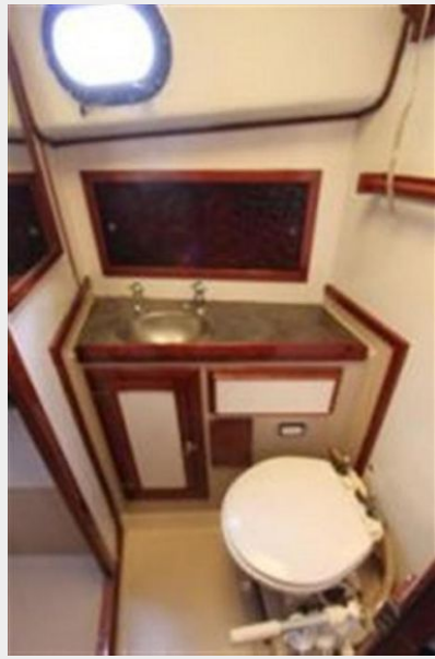
head next to separate shower forward