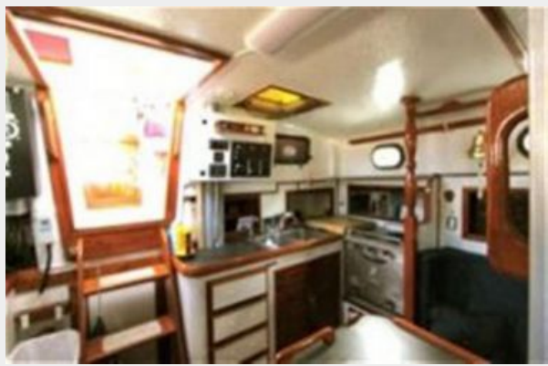
Salon facing companionway