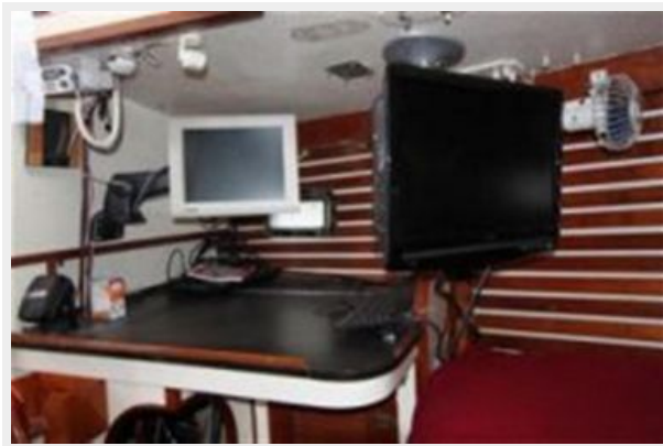
Nav station in Master