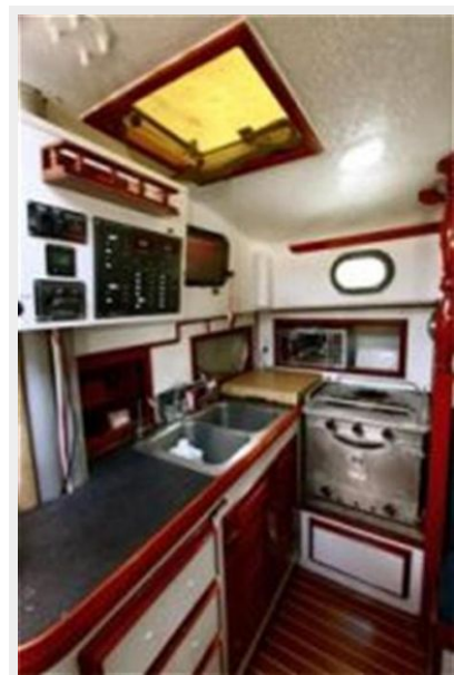
Galley with hatch above