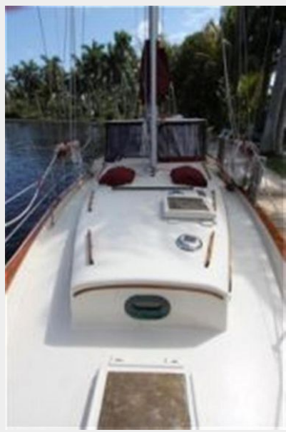
easy maintenance fiberglass decks