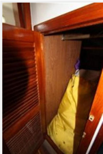
Forward hanging locker