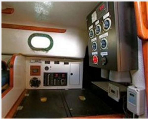
refrigerator and electrical