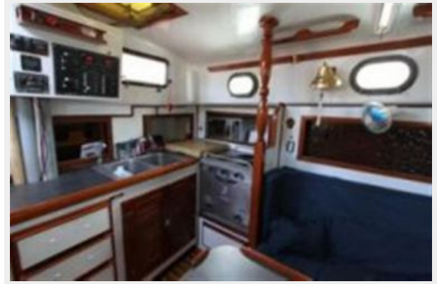
Salon facing aft