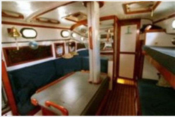
Main Salon facing forward