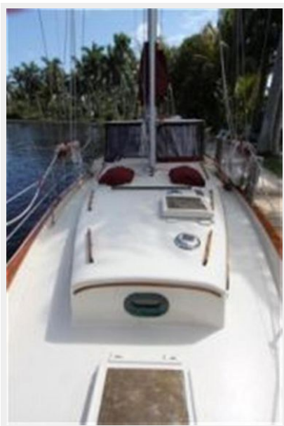
easy maintenance fiberglass decks