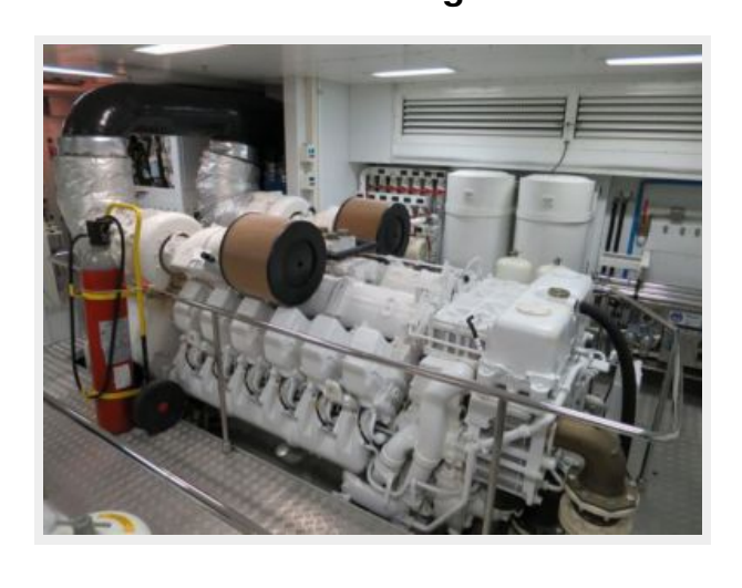
Port main engine