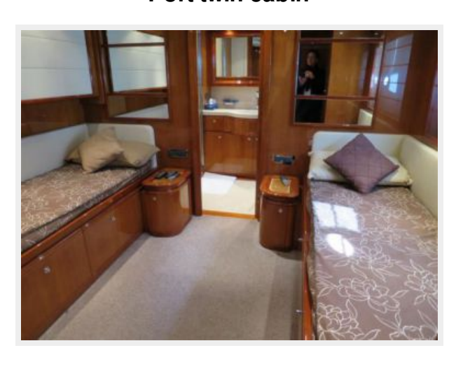
Port twin cabin