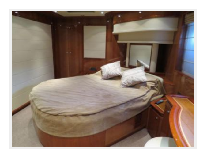
Stbd double cabin