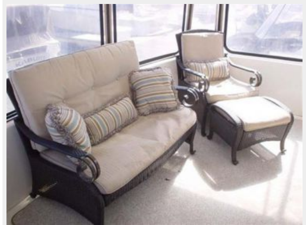
Aft Deck Port