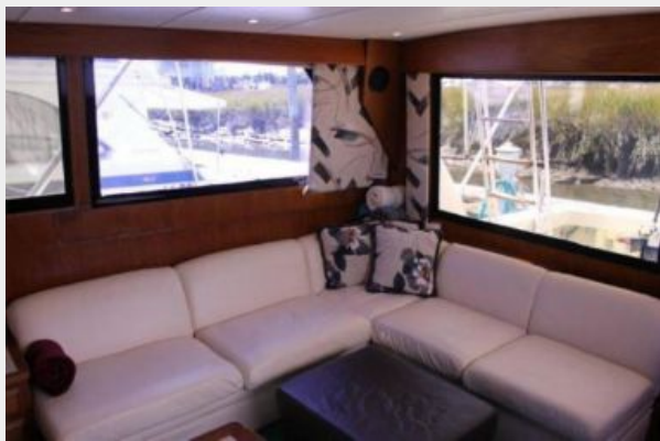
Salon Port Aft