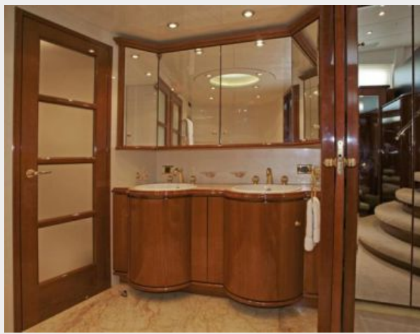
Master Bath Sinks