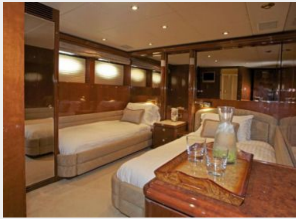
Guest Stateroom Starboard