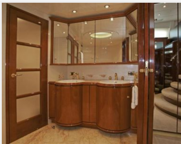
Master Bath Sinks