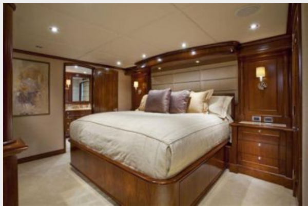
Guest Stateroom - Port King