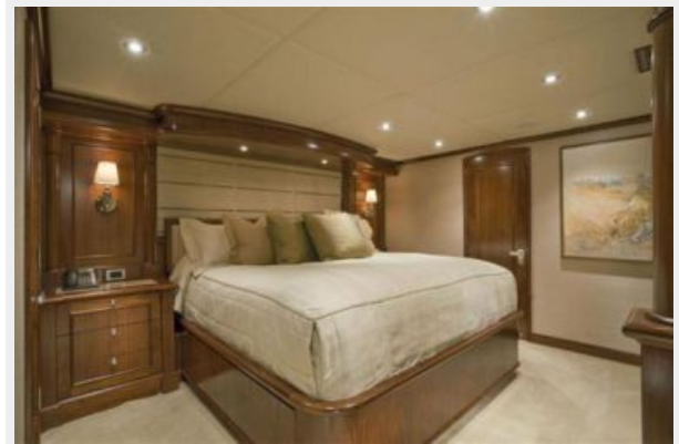
Guest Stateroom - Starboard King