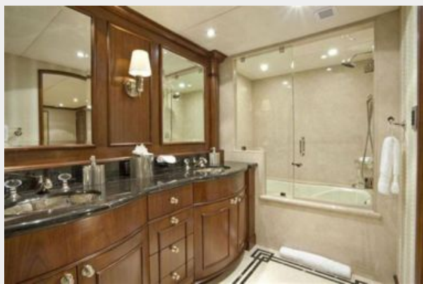
Guest Stateroom Bath - Starboard King