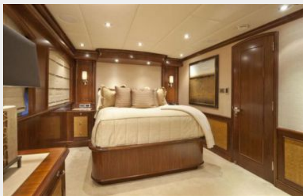
Guest Stateroom VIP - Skylounge