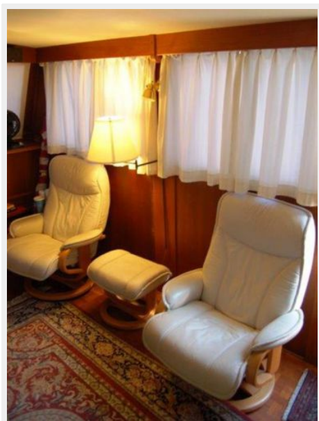
Salon to Port