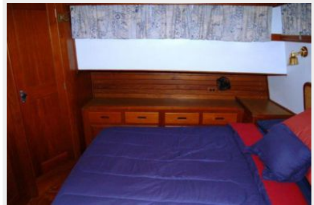
Master Staterom - View to Starboard