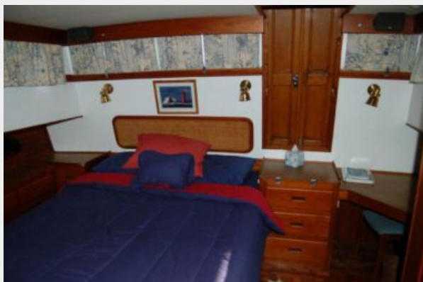
Master Stateroom Looking Aft