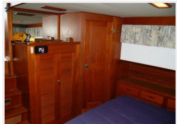
Master Stateroom Storage