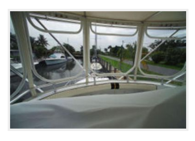
Helm with Cover