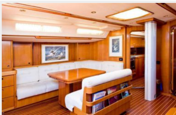
Salon, Dining Area