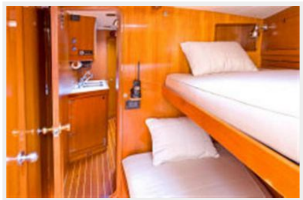
Crew Qtrs, Looking Aft into Galley