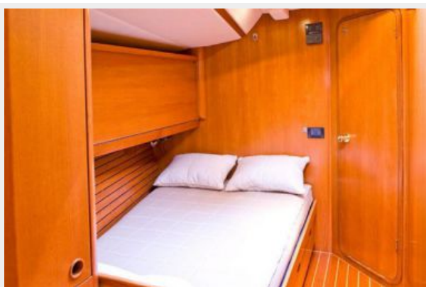
Stbd Guest, Looking Aft