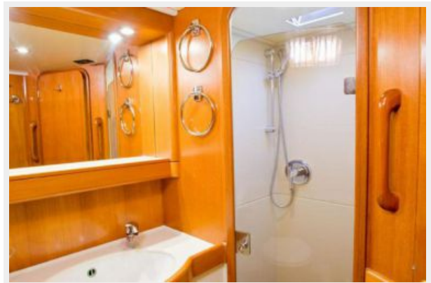
Master En Suite Head