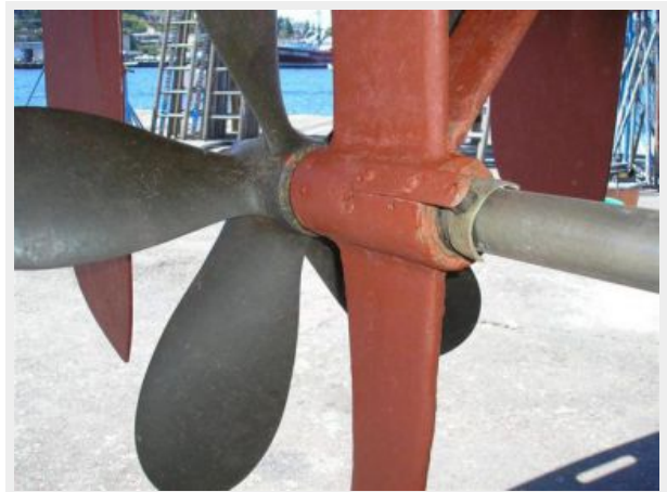
Cutlass Bearing w/Bonding System