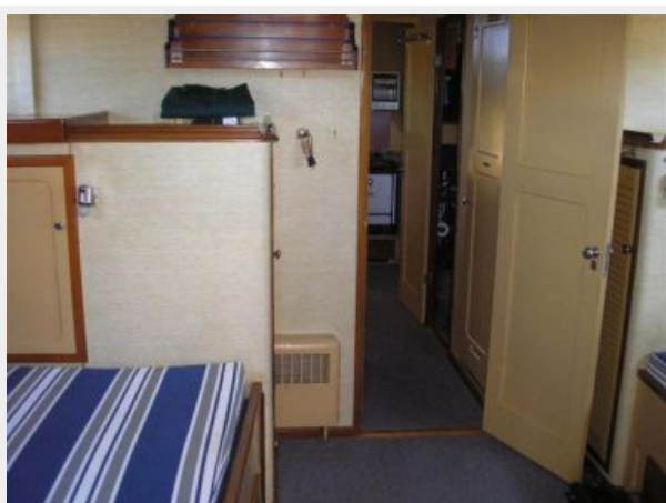
Master Cabin Looking Forward