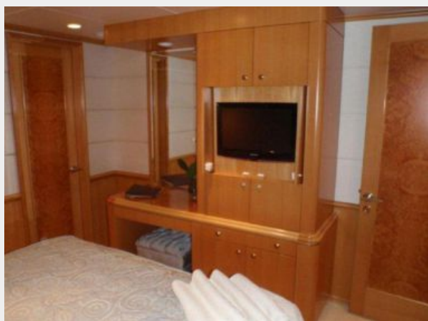
Stbd. Guest Stateroom