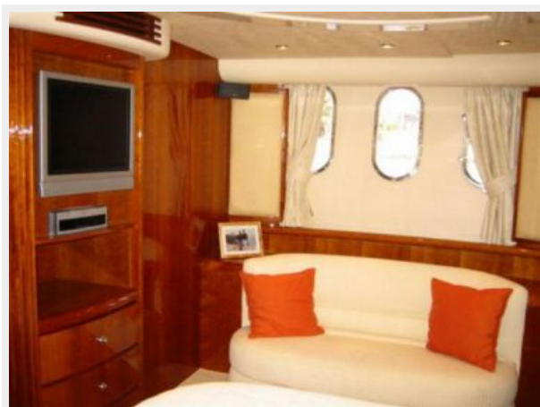
Master Stateroom Settee