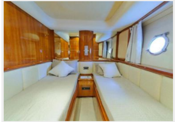
Twin Guest Stateroom #1