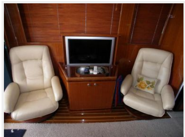
Salon Port Side TV Deployed