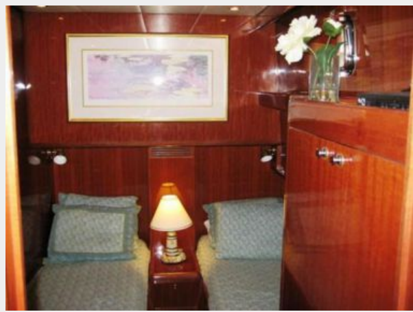
Guest Stateroom #1