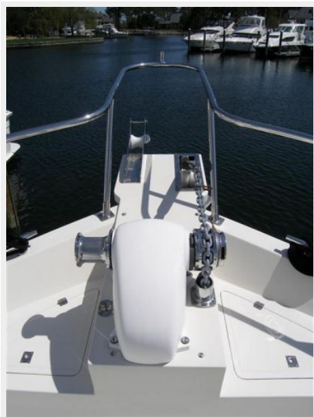
Bow Pulpit & Anchor