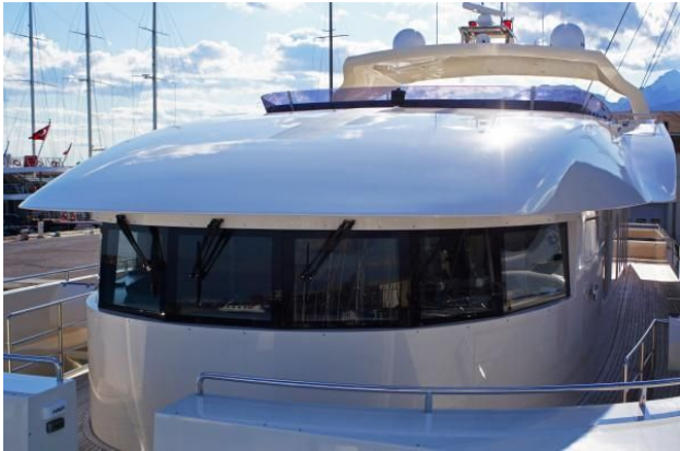
Bridge Radar Arch