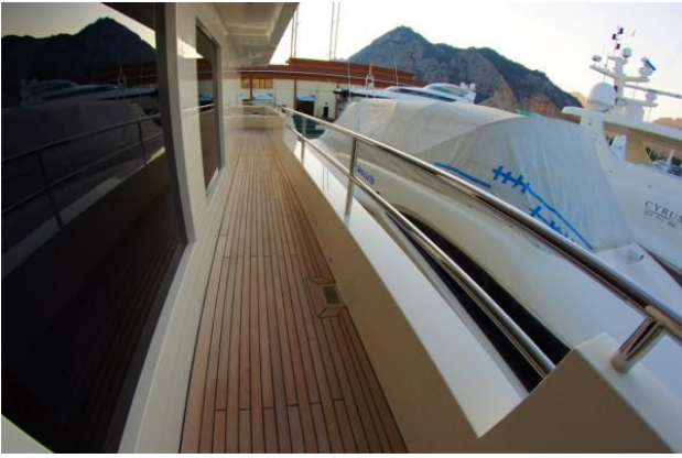
Starboard Side Deck